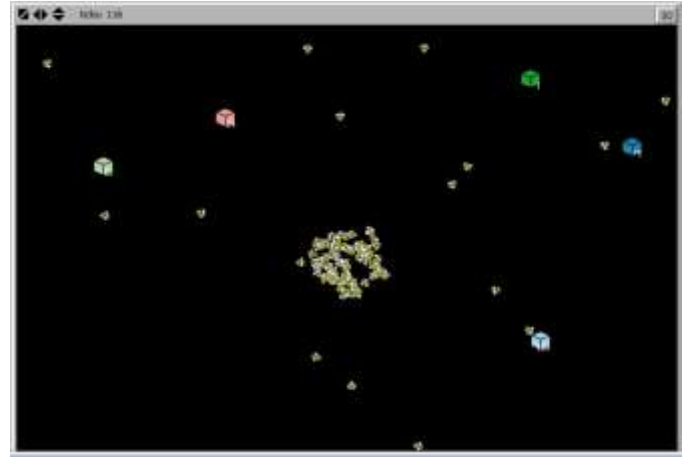
Figure 4: Global View of Honey bees for Smart Hive finding.

Hive Number=5 Initial Percentage=25 Initial-Explore-time=100 Quorum=50