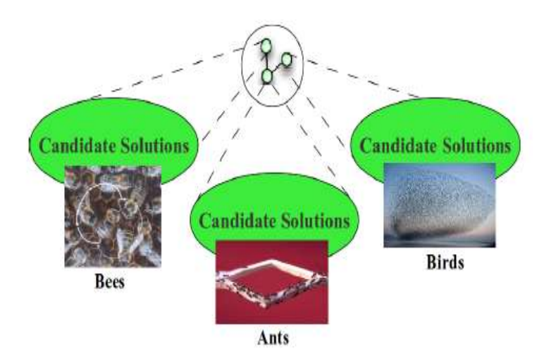
Figure. 2: Elements of Computational Ecosystem.

Basic Description: A computational ecosystem for optimization is composed by candidate solutions (individuals) scattered in an environment that, itself, is the search space of the problem being solved. Figure 2 shows a possible representation for the elements of the proposed computational ecosystem. This figure shows three populations where each population behaves according to the mechanisms of intensification and diversification, tuned by the control parameters, specific of a optimization strategy. In this example, the behavior of individuals is driven by the foraging strategies of bees, the foraging strategies of ants, and by the flocking behavior of birds, respectively.